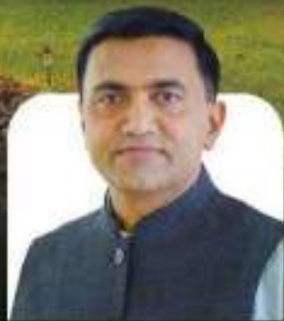
DR. PRAMOD SAWANT Hon'ble Chief Minister of Goa