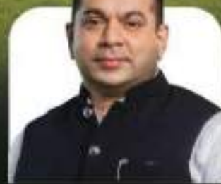
SHRI. ROHAN A. KHAUNTE Hon'ble Minister for Tourism, IT, E&C, Printing & Stationary, Govt. of Goa