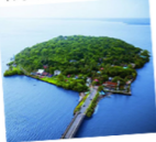
Caption: A bird eye view of São Jacinto Island