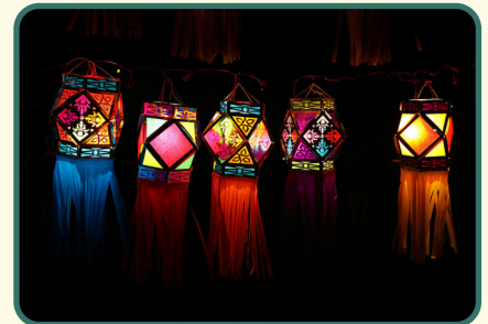
Diwali (27 th October 2019)