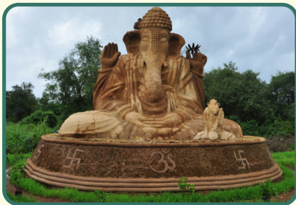
Ganesh Chaturthi (2 nd September 2019)