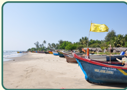
World Tourism Day (27 th September 2019)