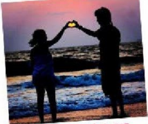
Cherished moment between loved ones on the beach