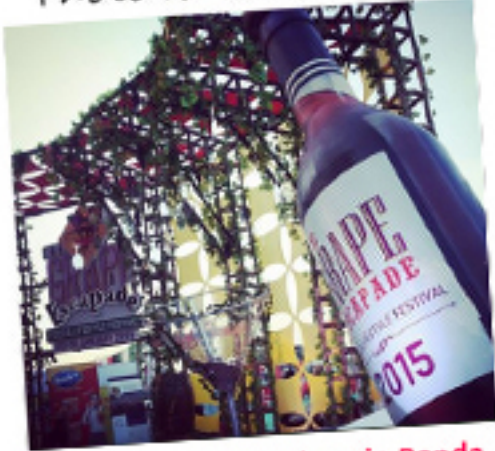
Christmas Celebrations in Ponda