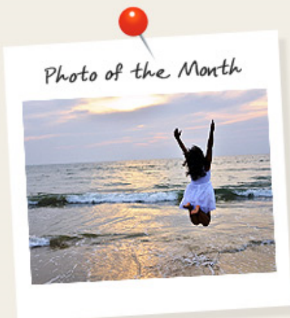
Photo of the Month

- Mr Manohar Parrikar, Chief Minister, Government of Goa