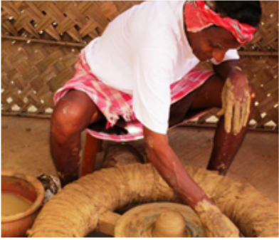
A potter showing off his pottery skills at the Goa International Travel Mart, 2014